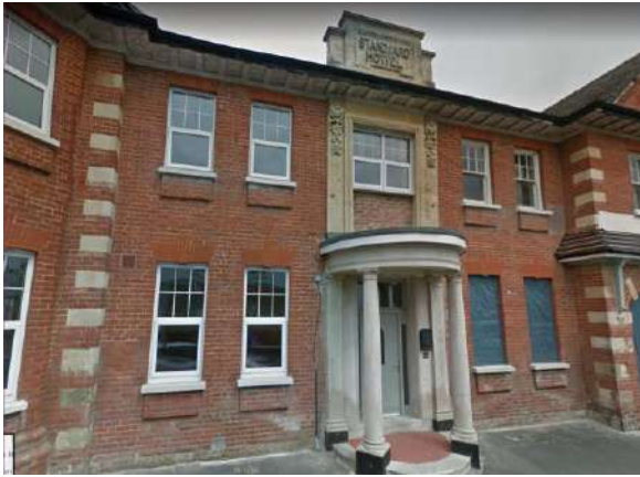
The Former Royal Standard Hotel

100yds back down School Green Road, just opposite the modern Sainsbury's, is the once celebrated Royal Standard Hotel, a former Burt's House, now sadly passing through successive hands, never fulfilling the promise of re-opening.