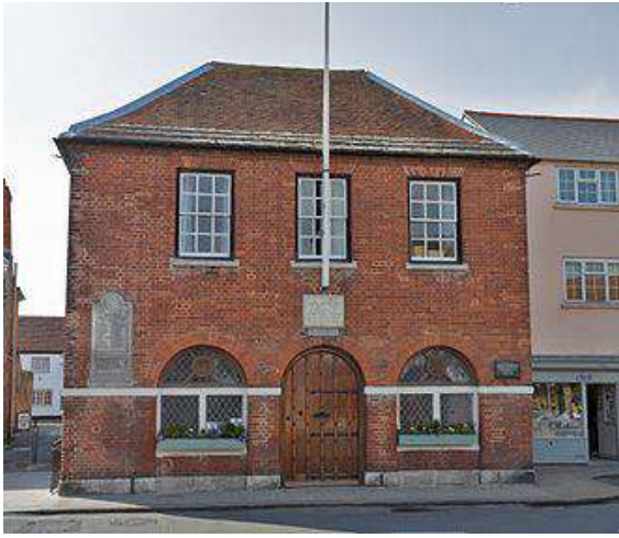
Yarmouth Town Hall

The Old Gaffers festival at the end of May has been running for some 20 years, and is a whole town festival, although currently running bi-annually, it is a festival that typifies the spirit of Yarmouth.