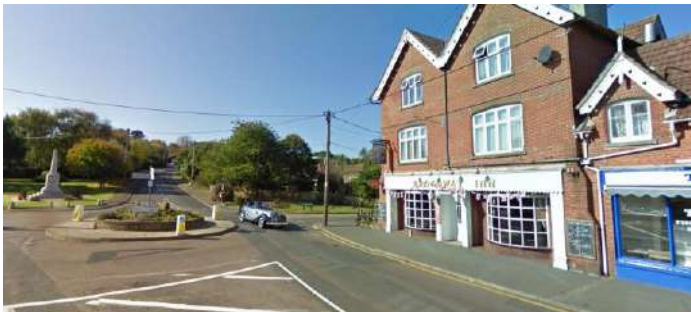
Totland Memorial Roundabout & The Broadway Inn

Crossing over to Queens Road, then turning to go along Clayton Road takes you to the T13, opposite the junction with Court Road, and leading into Colmar Way, with a left turn along uplands Road and right into Kendal Road onto The Broadway, Totland, where, just before the monument roundabout, is the former Broadway Inn, now Tea Rooms & Post Office, and which, in the time of Marconi was the Post Office of historical note.